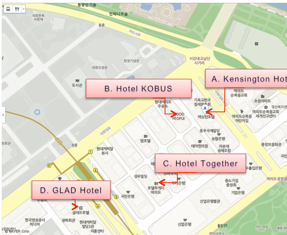
Kensington Hotel (A), Hotel KOBOS(B), Hotel Together(C), GLAD Hotel(D)