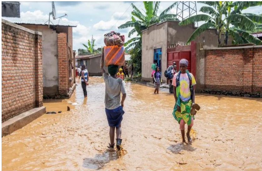
Image: flooding in Rubavu district on 04 may 2023